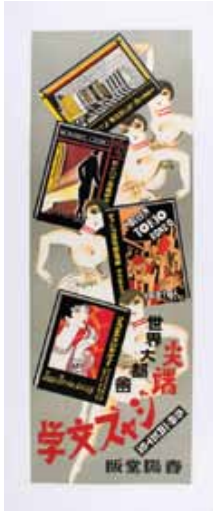
BELOW: HOROYOI (TIPSY), KOBAYAKAWA KIYOSKI

WHEN SEASON ROLLS AROUND, PALM BEACHERS KNOW THEY CAN COUNT ON THE SOCIETY OF THE FOUR ARTS FOR WORLD-CLASS PERFORMANCES, SPEAKERS AND EXHIBITIONS. THE FOUR ARTS WILL KICK OFF ITS 2013-14 SEASON OF ART EXHIBITS NOVEMBER 23 WITH "DECO JAPAN: SHAPING ART AND CULTURE, 1920-1945," ON DISPLAY AT THE ESTHER B. O'KEEFE GALLERY THROUGH JANUARY 10. IN THE 1920S AND '30S, THE ART DECO MOVEMENT PERMEATED THE GLOBAL DESIGN AESTHETIC, PARTICULARLY IN JAPAN, WHERE SOCIAL AND CULTURAL INFLUENCES REFLECTED THE COUNTRY'S HISTORY AND ITS BURGEONING COSMOPOLITANISM. "DECO JAPAN" FEATURES NEARLY 200 PIECES—INCLUDING FINE ART ITEMS AS WELL AS MASS-PRODUCED DECOR—THAT SIGNIFY THE COUNTRY'S SHIFT TO MODERNITY. (561-655-7226, FOURARTS.ORG )