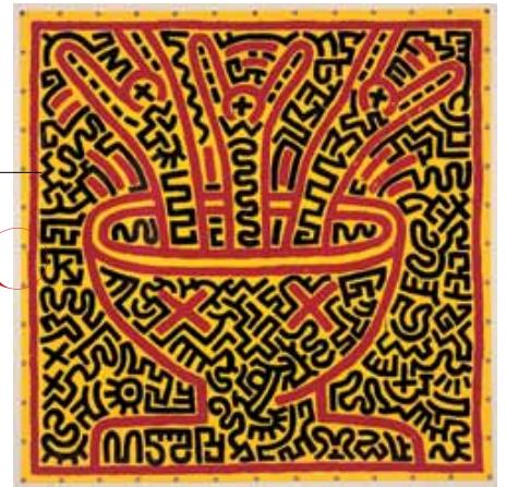
Untitled, KEITH HARING